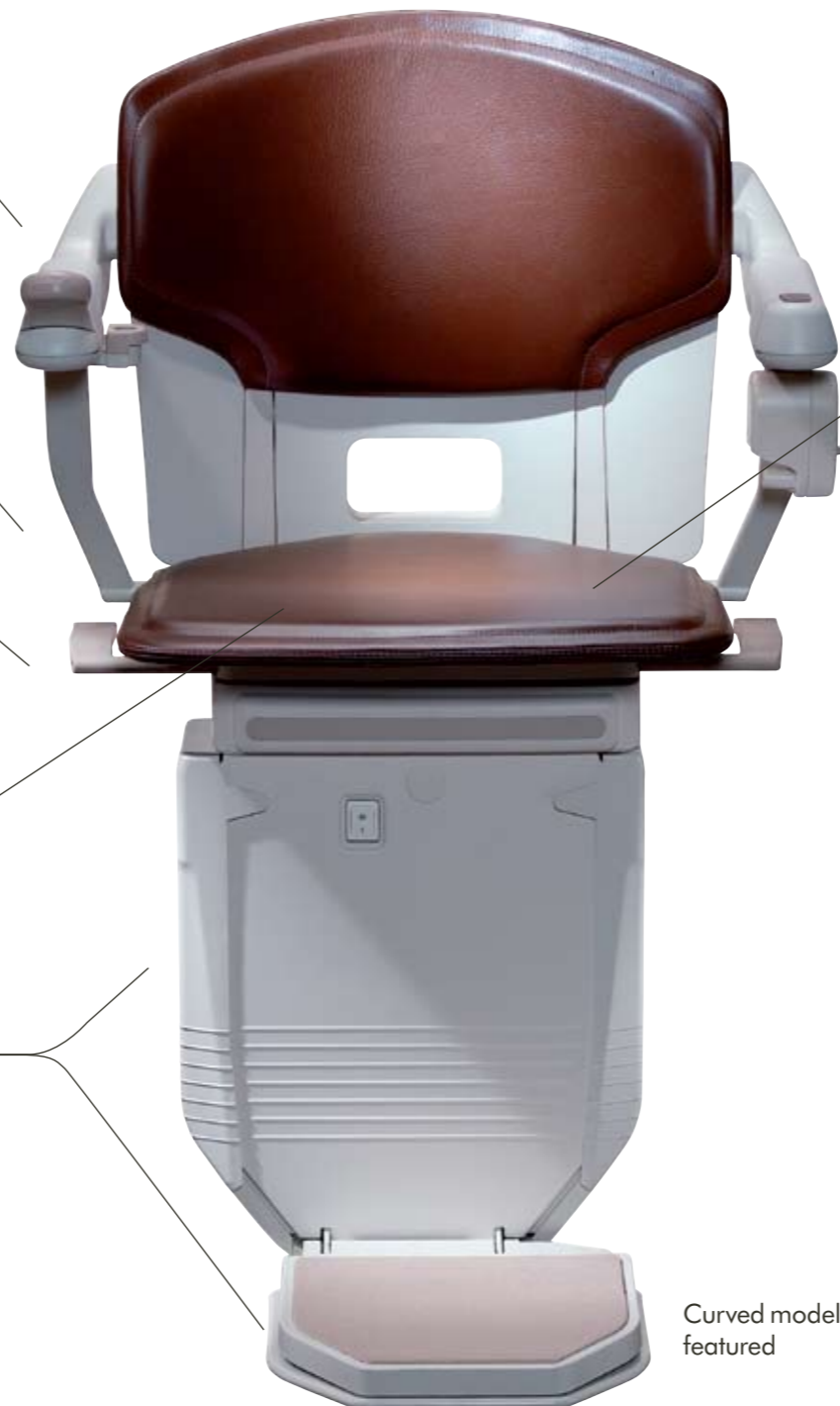
Curved model featured